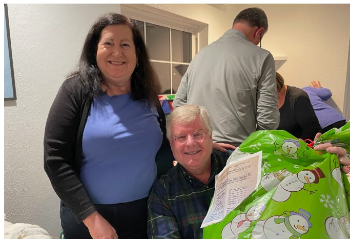
Adopt-A-Family Gift Wrapping, 2023