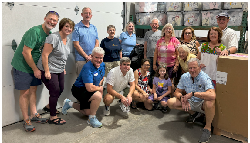
Food Packing - August 2024

For more information on Thanksgiving food packing or donations, please contact Harrison Hobgood at harrison@asecfw.org .