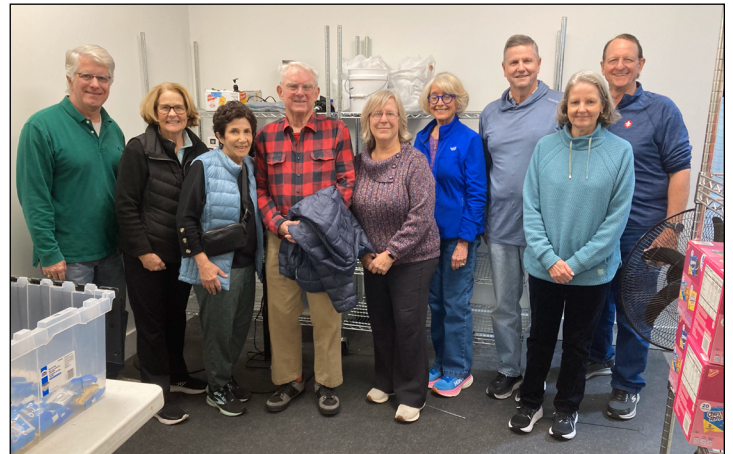
Food Packing on Sunday, January 12