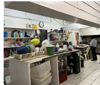
Newly repainted kitchen.