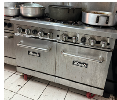
Repaired burner stove