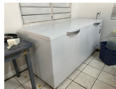
Brand new deep freezer