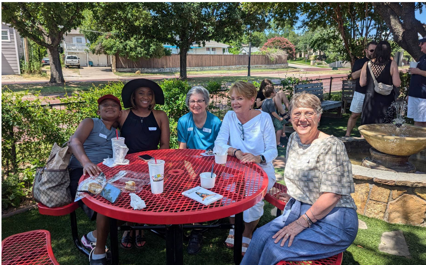
ECW Ice Cream Social - Read more on Page 3