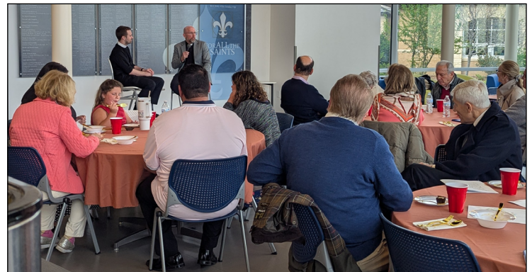
Special Evensong Reception on April 6.