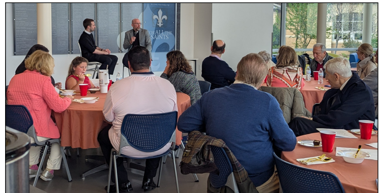
Special Evensong Reception on April 6.