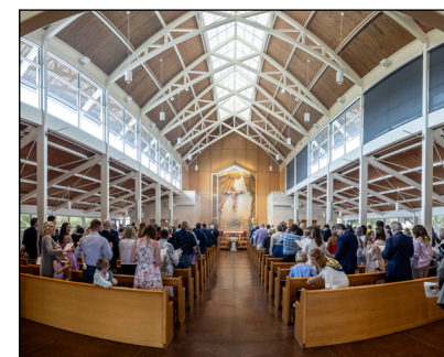
Easter Sunday, 2024