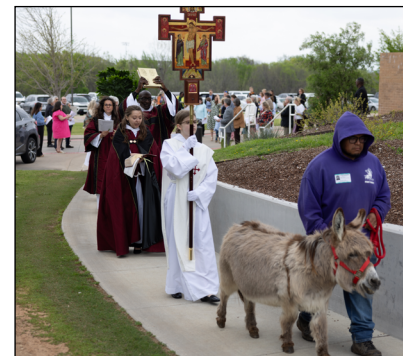
Palm Sunday Procession, 2024

Easter Morning, April 20 at 9:00 a.m. and 11:15 a.m. – Easter morning is pure celebration! Sing your favorite Easter hymns, receive Holy Communion, and proclaim that the Lord is risen indeed! This service features the All Saints' Brass Quintet and Timpani.