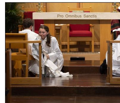
Maundy Thursday, 2024