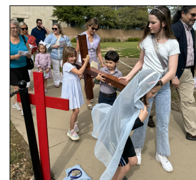
Children's Stations of the Cross, 2024