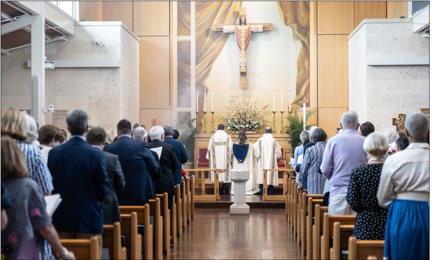
Easter Sunday, 2024 - Read more on Page 1.