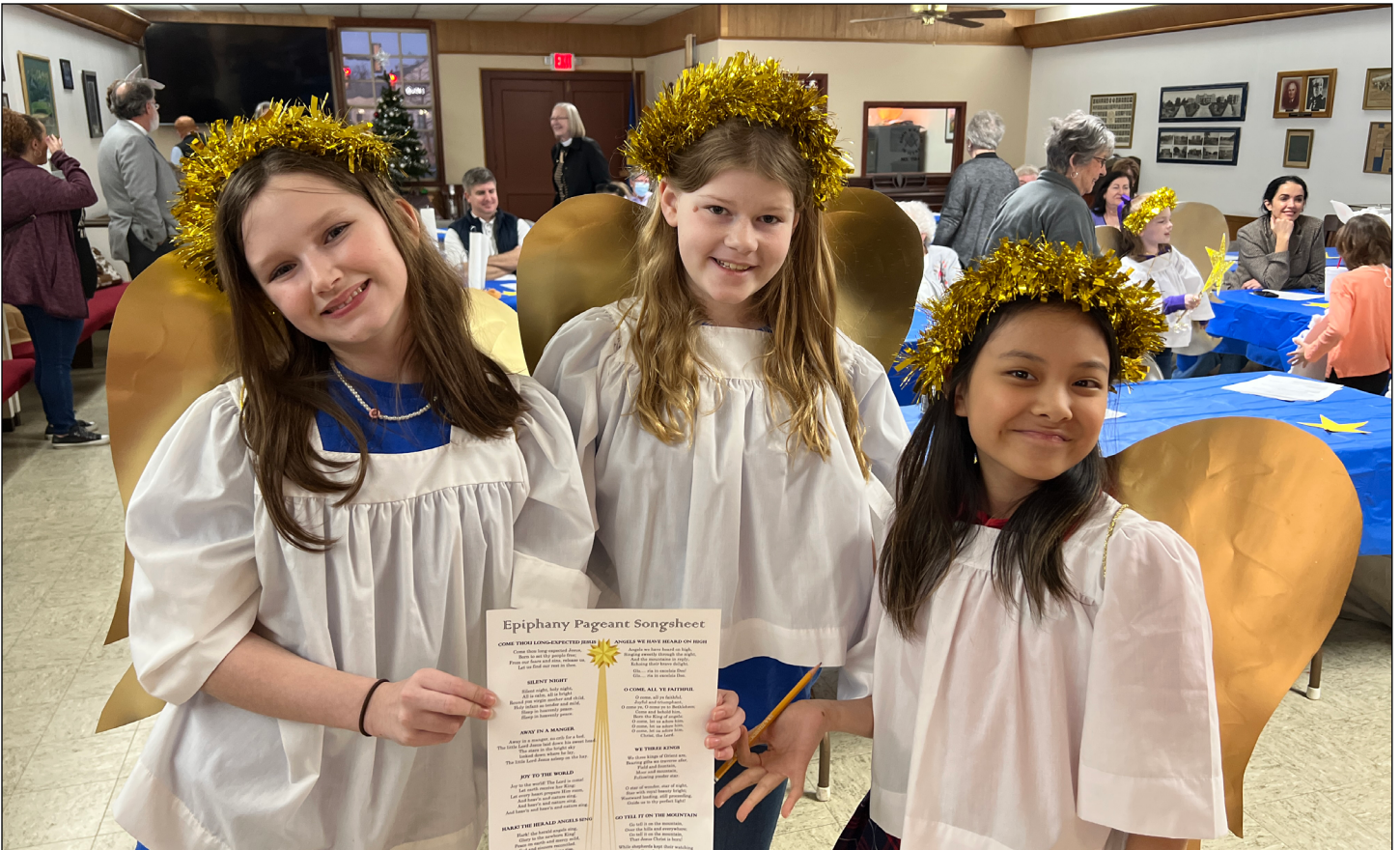
Epiphany Pageant 2023 - Read more on Page 1