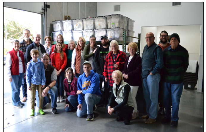
Food Packing on Sunday, December 22