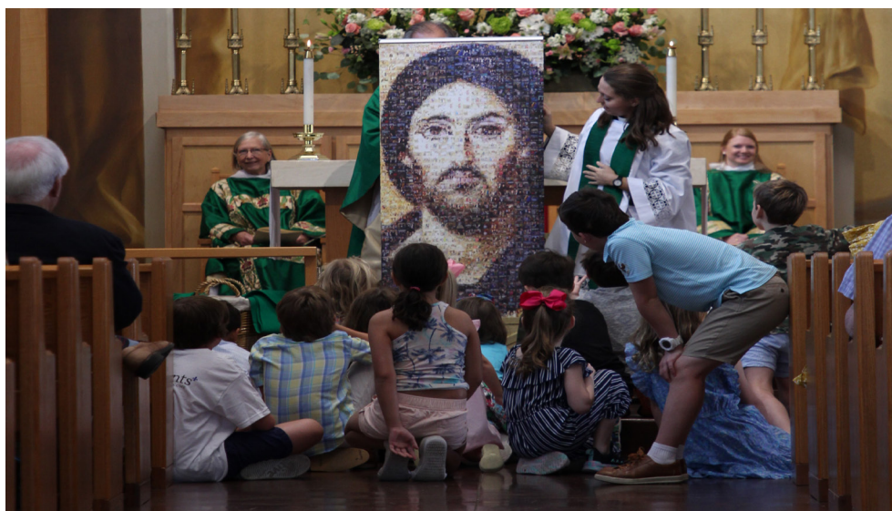
Rally Day, 2023