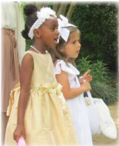
Waiting for the signal to "Go!"