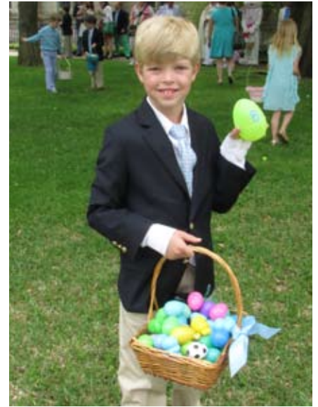
A youngster finds one of 12 "special eggs" at The Easter Hopping Egg Hunt. More on page 5.