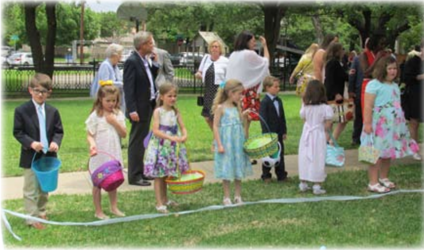
Children wait for the start of the Easter Egg Hunt.