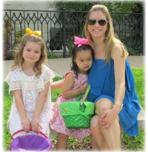
It's a good idea to bring a basket to church on Easter.