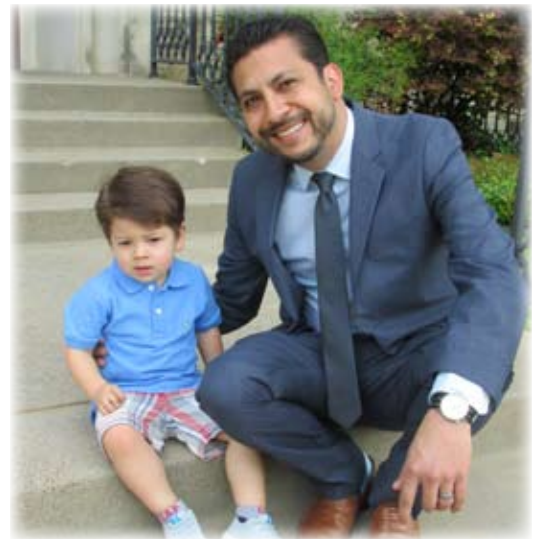
Father and son arrive for church.