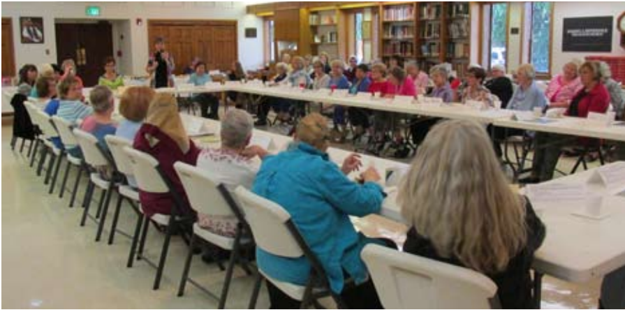
Attendees at Daughters of Abraham in DeWolfe Hall on April 26.