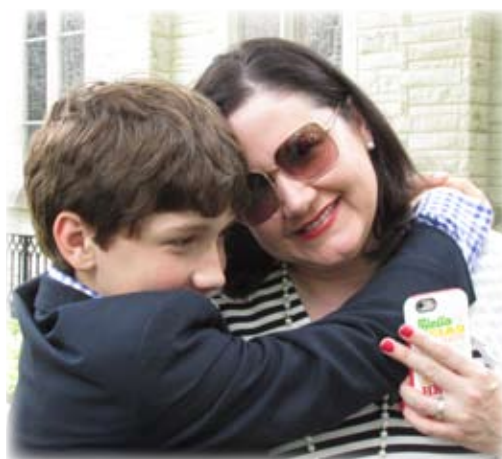
An Easter Day hug.