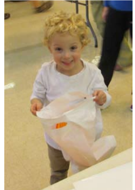
Our littlest participant in Packing Food for Kids loves taking part in this activity with his mother.