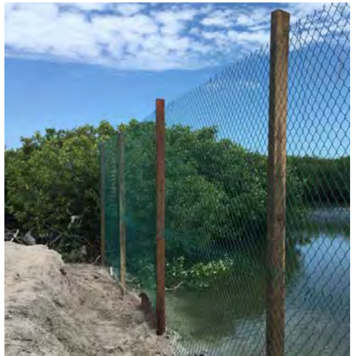
Water hazard! Our missionaries installed this chain-link fence to keep basketballs from the new court from bouncing into this lagoon, where alligators are sometimes seen.