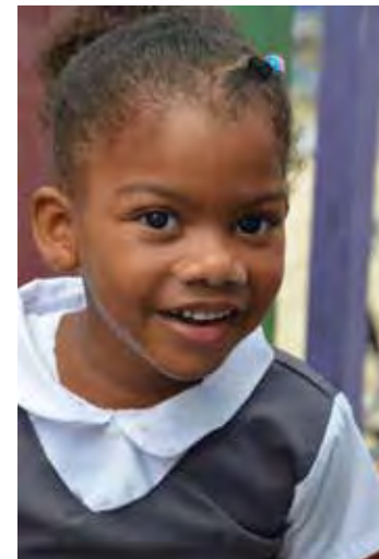
A young Holy Cross student in her school uniform.