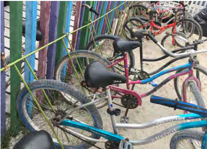
The finished bike rack constructed from rebar.