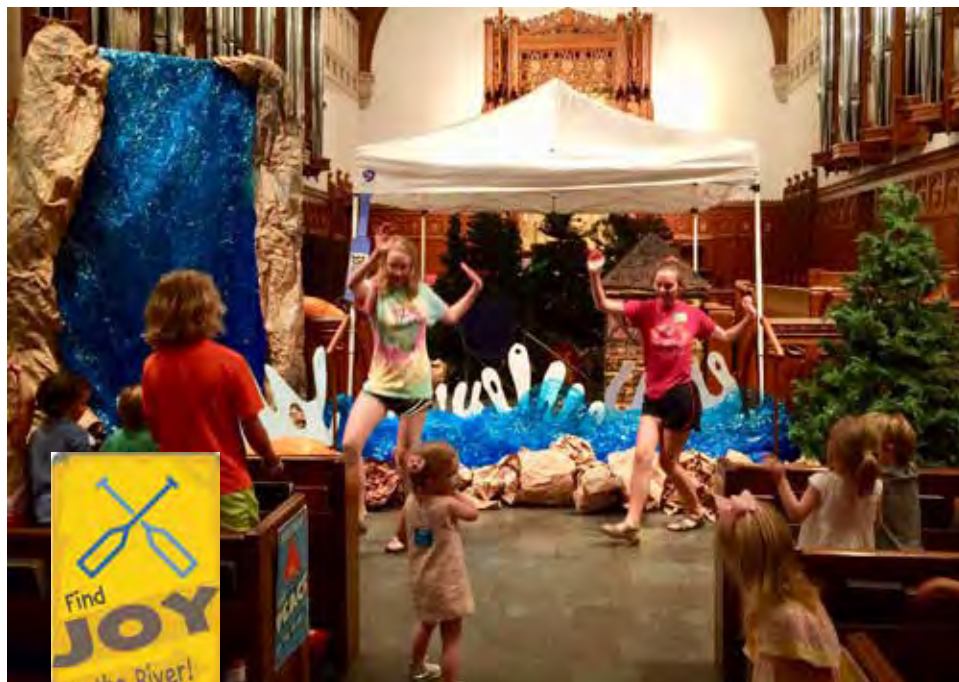
Several All Saints' teens served as music and drama leaders.