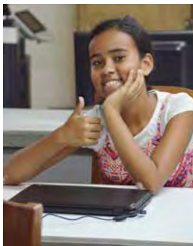
A student gives the thumbs-up to one of the new Chromebook laptops brought by All Saints' missioners.