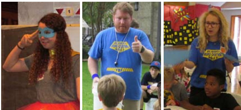
Just three of our VBS volunteers!