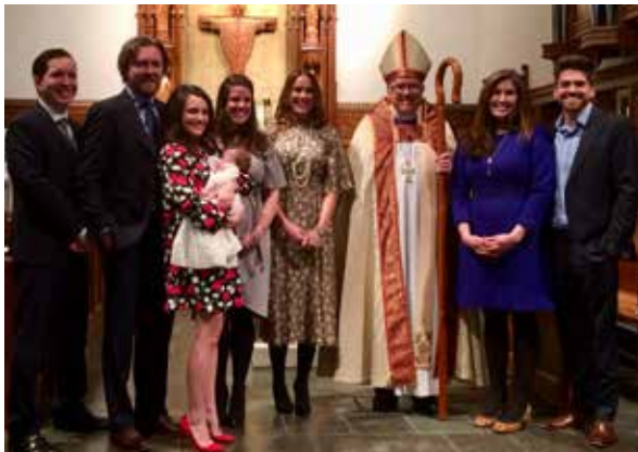
Congratulations to the families whose young children received Holy Baptism on January 13.