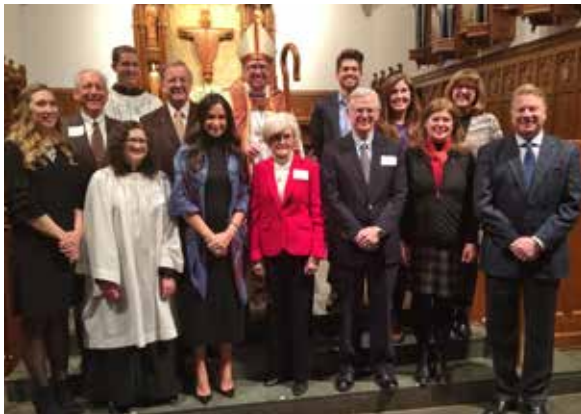
Congratulations to the adults who were confirmed or who reaffirmed their baptismal vows on Jan. 13.