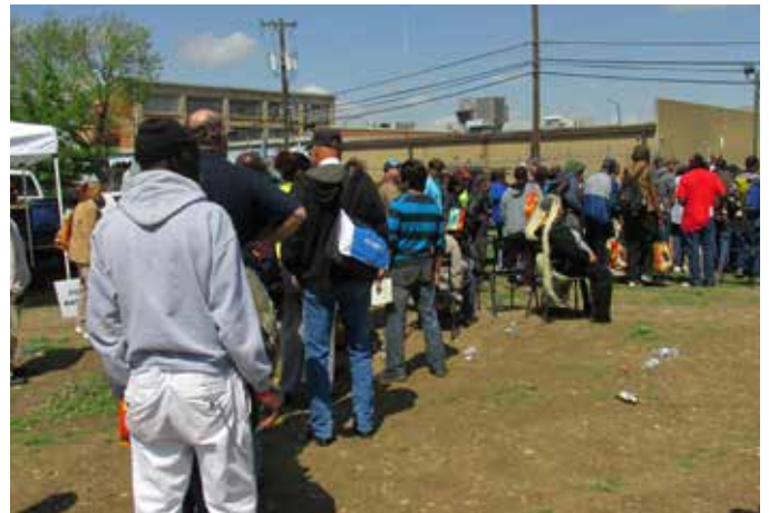
Queuing up for shoes: People who hoped to receive a pair of shoes formed a line to receive them.

Serving in the Foot Clinic at Unity Park was such an eye-opener and a humbling experience! To see the needs of so many individuals was overwhelming. Most were extremely appreciative to us and to the young students from All Saints' School who handled themselves so maturely. I will definitely serve again.