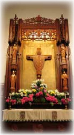
Easter flowers at All Saints'.

Non-Profit U.S. Postage PAID Fort Worth, Texas Permit No. 1628